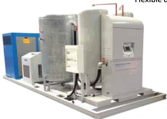
Skid- mounting with power cabinet

Flexible design available for indoor and outdoor locations