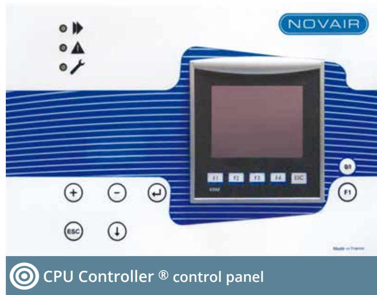
CPU Controller ® control panel