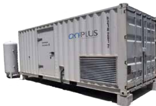
In container equipped with power cabinet, ventilation and lighting