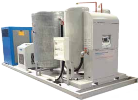
Skid- mounting with power cabinet

Flexible design available for indoor and outdoor locations