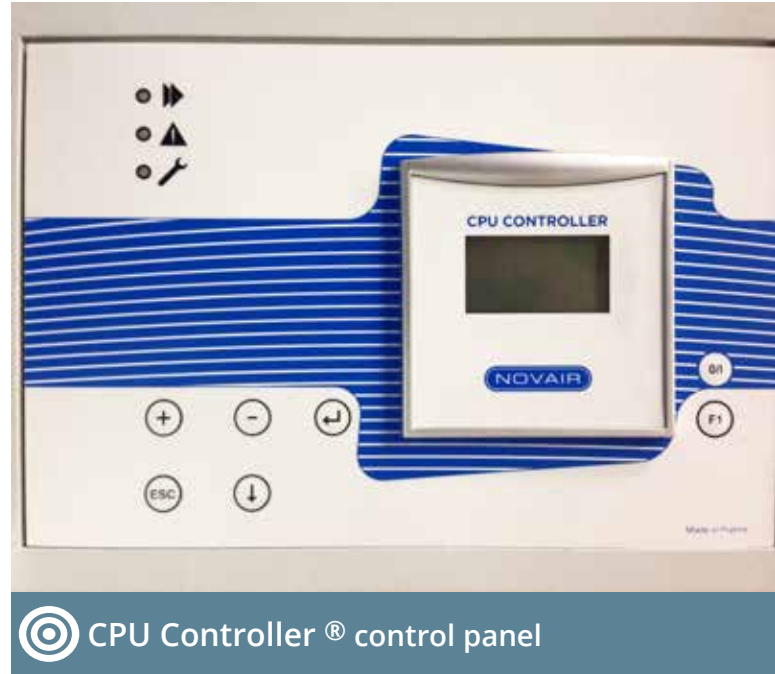
CPU Controller ® control panel