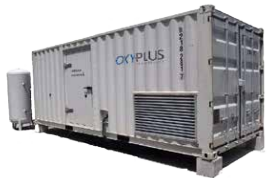
In container equipped with power cabinet, ventilation and lighting